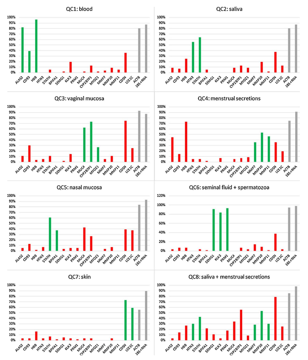
Fig. 1. Detection frequency of tissue-specific and housekeeping markers in mRNA profiling experiments (four replicates of the multiplex PCR reaction were performed for each stain). Stain-specific markers are highlighted in green, markers expected to be co-expressed in light green, housekeeping genes in grey, other markers in red. (For interpretation of the references to colour in this figure legend, the reader is referred to the web version of this article.)

fluids. Although cross-reactivity could not be excluded in collection sites of QC3, QC4 and QC8 (vulval vestibule) and QC5 (rim of the nostrils), the fact that the unexpected observation of CDSN was recurring in the same 5 laboratories also suggested possible contamination of plastics/reagents. On the contrary, CDSN expression was observed by all but one GEFI laboratory in vaginal mucosa, confirming the occurrence of CDSN false positive signals in such tissue [5].